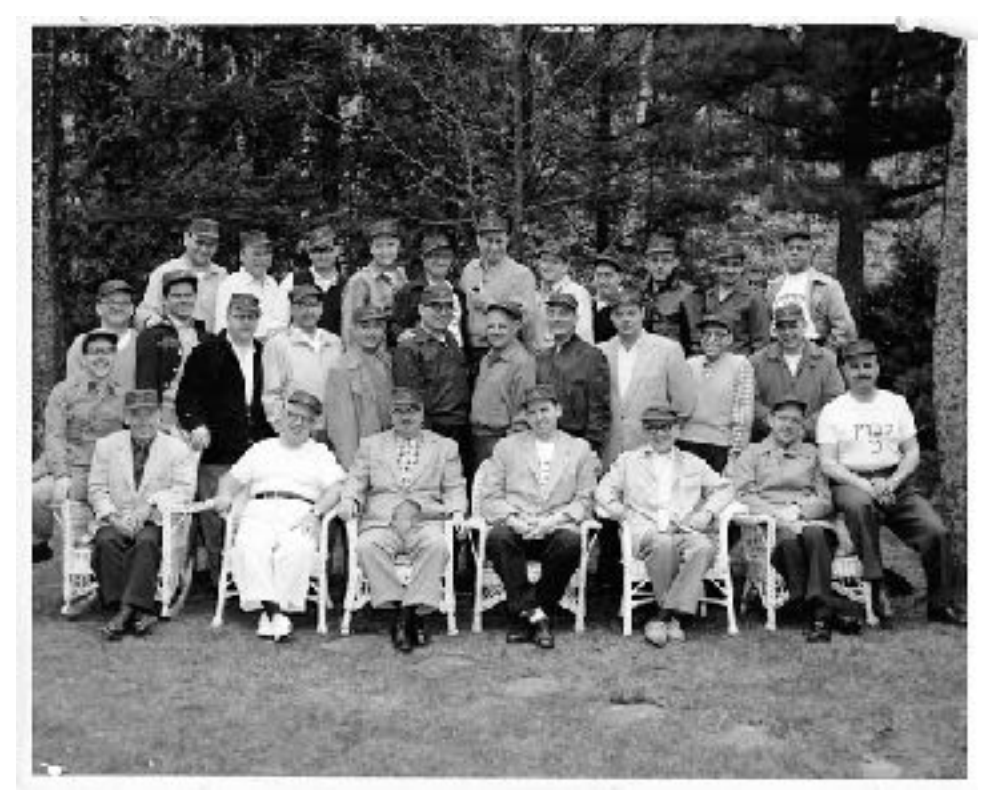
Men's Club at Traverse City retreat - 1956