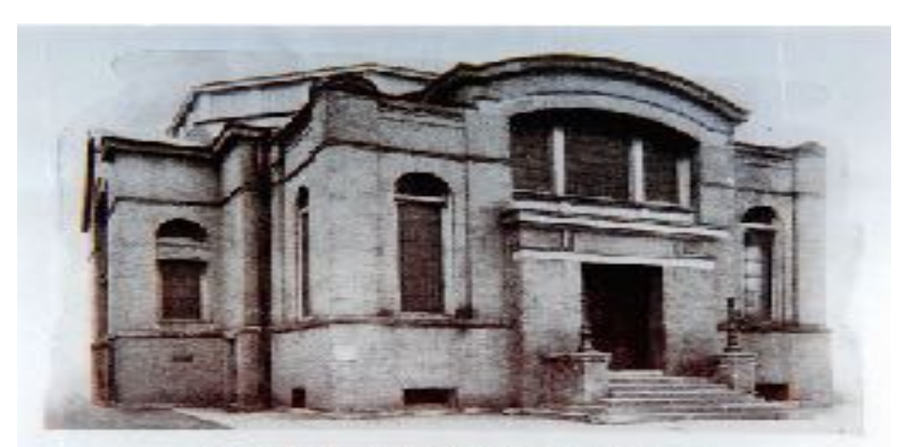
Shaarey Zedek - Horns from 1905 to 1913 The Winder Street Support

Over the years, Congregation Shaarey Zedek has been located in a number of beautiful and picturesque buildings. These include Winder between St. Antoine and Beaubien Streets, Willis Street E and Brush, and Chicago Boulevard and Lawton, which is still standing.