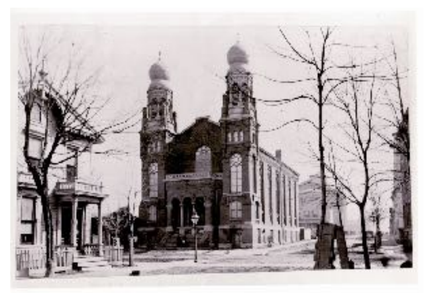
Congress and St. Antoine – 1877 to 1903

In 1861, at the beginning of the Civil War, seventeen followers of Traditional Judaism withdrew from the Beth El Society in Detroit to found the Shaarey Zedek Society. Then, in 1877 the membership constructed the first building in the Detroit area to be erected specifically as a synagogue, at Congress and St. Antoine.