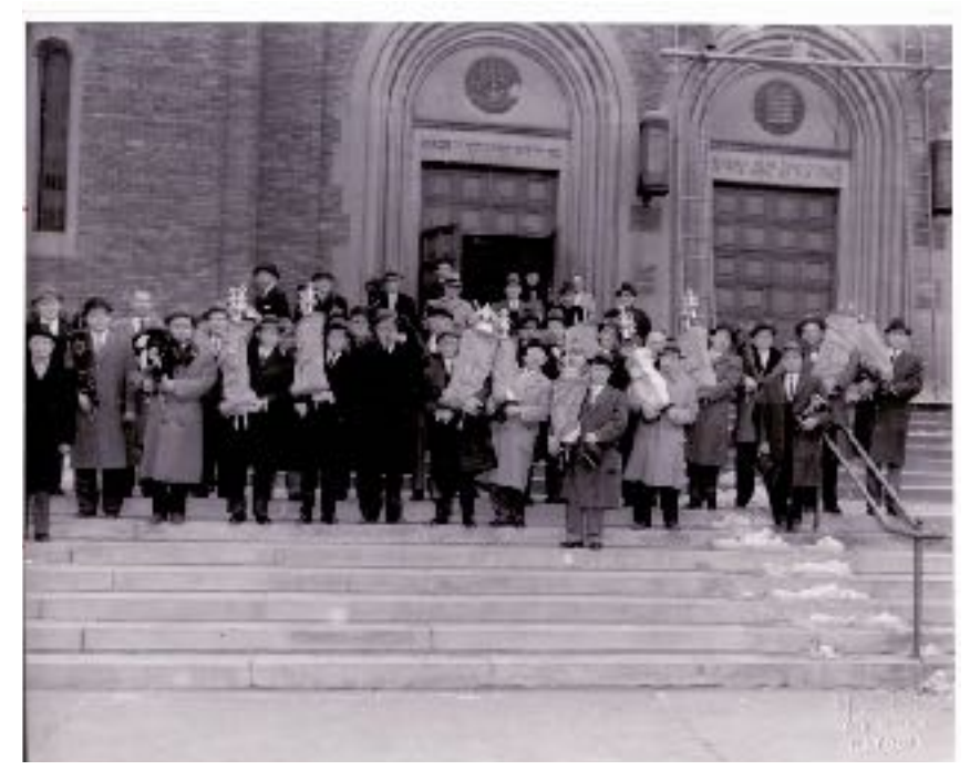
Moving the Torahs from Chicago Blvd. to Bell Road – 1962