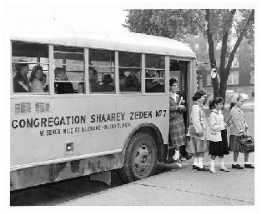
Students attending CSZ Religious School on Seven Mile Rd. – 1950s